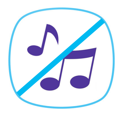
Sound equipment is not allowed in the fitness room with the exception of headphones.

Visiting the fitness room is entirely at your own risk. If you have a medical condition (e.g. epilepsy), please report this in advance at the reception desk of the swimming pool.