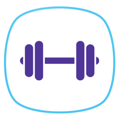
Dumbbells, weights and benches must be replaced in their original position after use. Clean fitness and cardio machines after use.