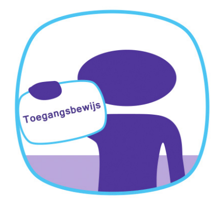
Access is only granted if you are in possession of a valid ticket.

We warmly welcome you to the fitness room of Holiday Park De Krim. We strive to ensure that you and all our other guests can make optimal and safe use of this facility. That is why we have drawn up a number of rules of conduct. We ask that you read these rules, adhere to them and that you follow the instructions of our employees.