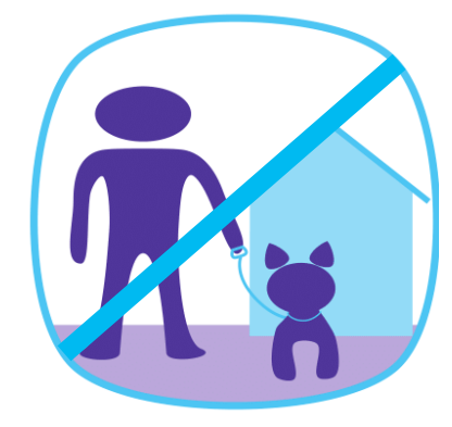
Pets are not allowed in the fitness room.