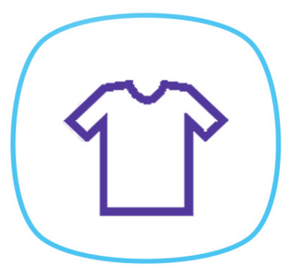
Only enter the fitness room with sports shoes and sportswear. Use of a towel is mandatory.