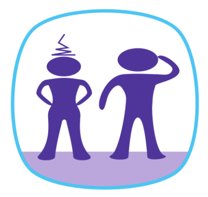
Intimacies of any kind will not be tolerated (wanted or unwanted).