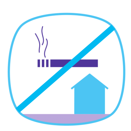
This is a non-smoking area. This also applies to e-cigarettes. The use of any form of alcoholic beverages or drugs is not allowed.