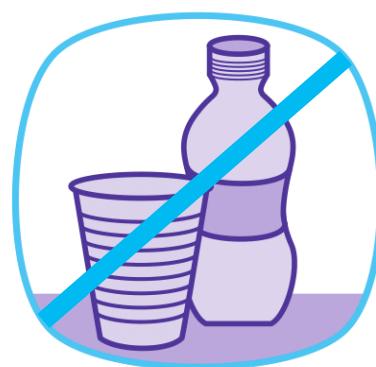
The same applies to glassware and food. Non-alcoholic beverages may be brought, on the condition that they are in a sealable container.